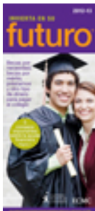
Brochure (1-1.1) Spanish

2012-13 Fund Your Future Counselor's Guide- The PowerPoint planning tool to help high school counselors and financial aid administrators create a presentation for their students and families on the basics of available financial aid and how to apply. Easy to follow PowerPoint with notes section allows you to customize a presentation.