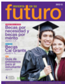
Workbook (1-3) Spanish

2012-13 Fund Your Future Brochure- An easy to use brochure covering the financial aid basics available in English and Spanish. Available online and in hard copy.